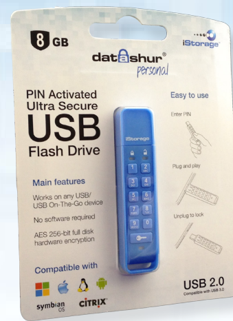
datAshur Personal in retail packaging